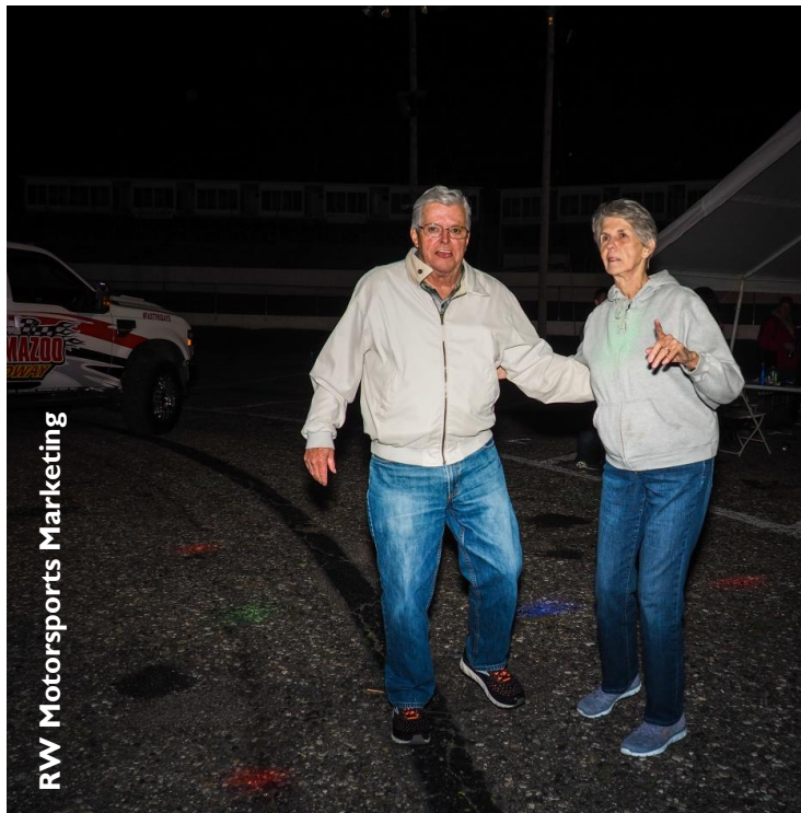
RW Motorsports Marketing