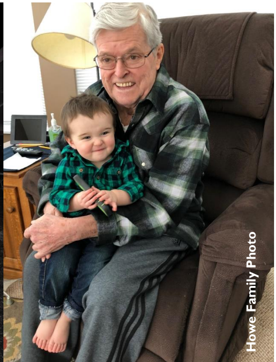
Howe Family Photo