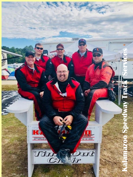
Kalamazoo Speedway Track Services