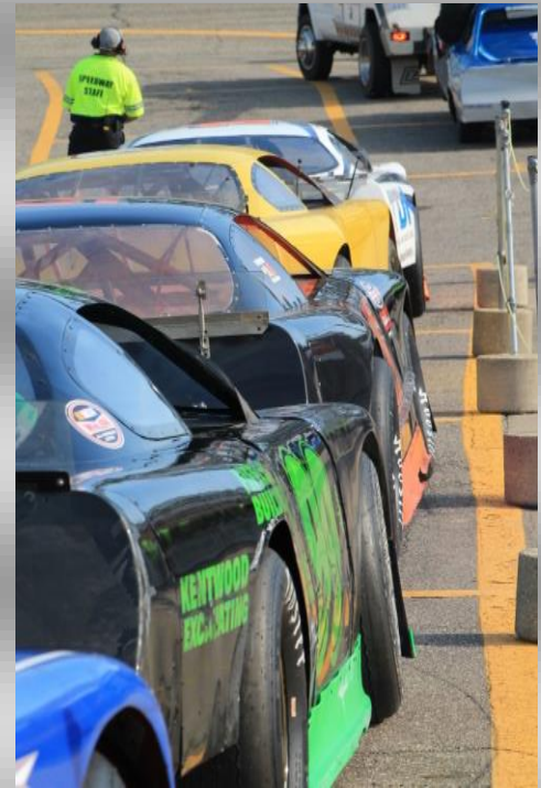
$1,000 to win 35 lap features for the Late Model Sportsman & Street Stocks