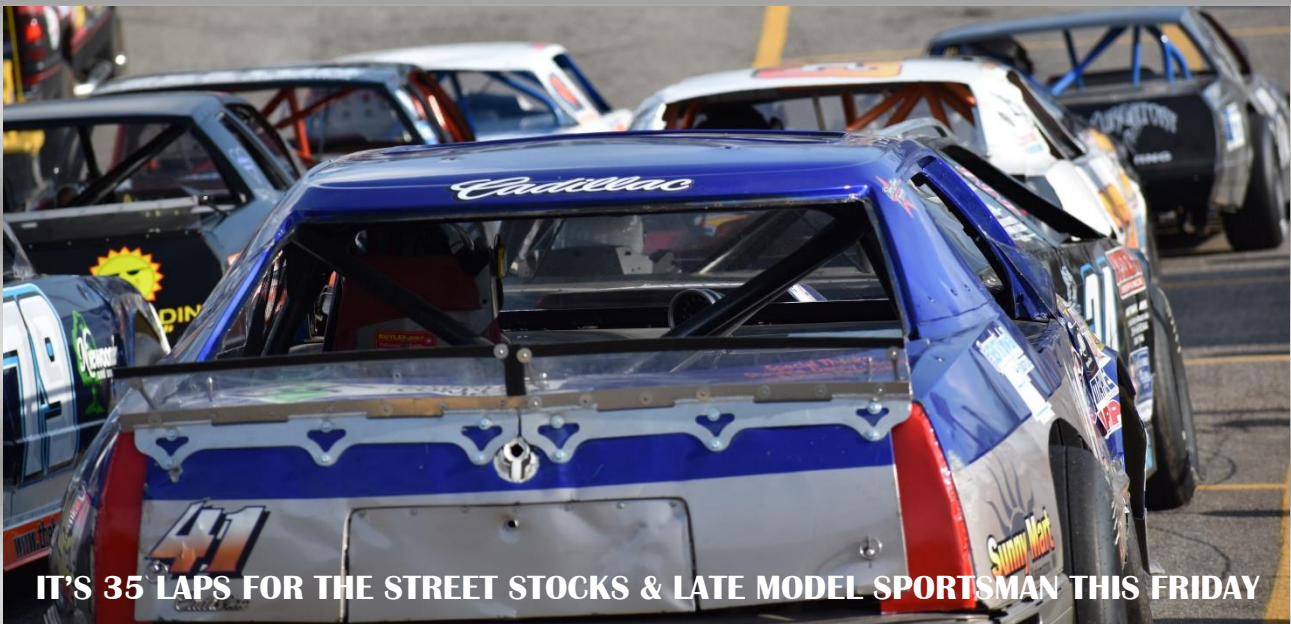
IT'S 35 LAPS FOR THE STREET STOCKS & LATE MODEL SPORTSMAN THIS FRIDAY