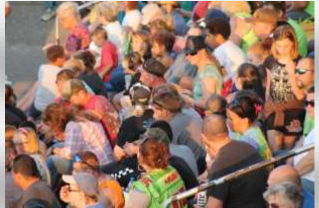
OPENING NIGHT - BE THERE!